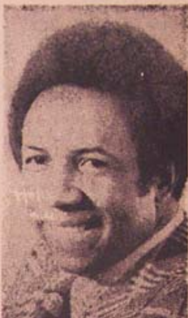
Brother FRANK ROBINSON has made baseball history by becoming the game's first Black manager.

"The decision to pioneer in the long-delayed promotion of a qualified Black athlete to the rank of manager is particularly noteworthy because it elevates to