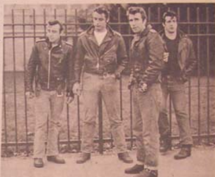
THE LORDS OF FLATBUSH (from left), "Wimpy," "Chico," "Butchie," and "Stanley."

This reviewer grew up in Flatbush, in the 1950s — eight blocks away from Ebbets Field, which the then-Brooklyn Dodgers baseball team called "home," to be exact. If Chico, Stanley, Wimpy and Butchie, the "Lords of Flatbush," acted the way they did throughout the movie, in real life, in the real 1950s in Flatbush, they would have never lived to have seen the 1960s; they might not have made it home from school — elementary school.