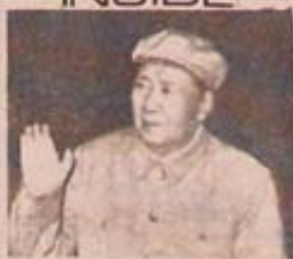
25th Anniversary of People's China, See Box, Page 15.