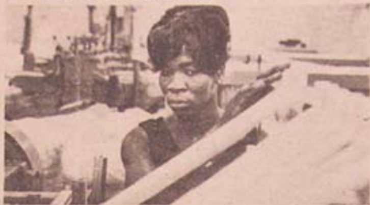
Black textile workers in the South receive wages and endure working conditions not far removed from slavery.