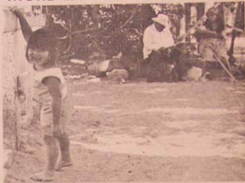
Native Americans, this country's only true "Americans," are organizing in increased numbers to protest over 400 years of oppression by the White man.

Opposing the expanded-land measure are conservative environmentalist organizations, the national Sierra Club and Friends of the Earth. They have mounted a massive effort to defeat the bill