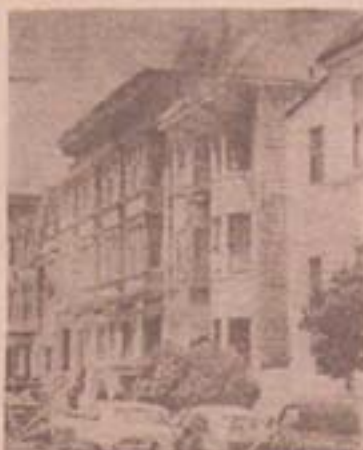
White Panther Party headquarters in San Francisco, California.

"This flimsy justification for a forced entry into a private home follows a sinister pattern now emerging. Police are using testimony of witnesses they know to be unreliable to precipitate violent confrontations with members of opposition political organizations."