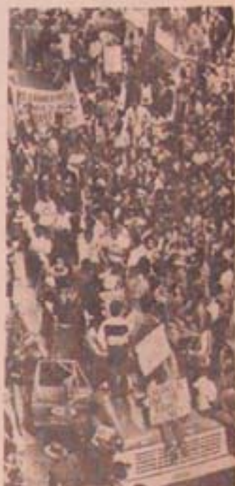
Peaceful civil rights protests, such as above, have often been met with armed police attacks.

The racist dog oppressors fear the armed people; they fear most of all Black people armed with weapons and the ideology of the Black Panther Party for Self-Defense. An unarmed people are slaves or are subject to slavery at any given moment. If a government is not afraid of the people it will arm the people against foreign aggression. Black people are held captive in the midst of their oppressors. There is a world of difference between thirty million unarmed submissive Black