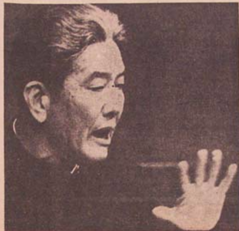
CHIAO KUAN-HUA, deputy foreign minister of the People's Republic of China, had high praise for the Arab countries' use of oil as a political weapon when he addressed the United Nations last week.

In regards to South Africa, the Black African-led campaign was overwhelmingly successful in its move to rebuff and humiliate the South African government delegation, with the Assembly voting 98 to 23, with 14 abstentions, to