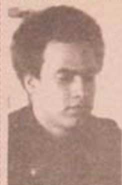
HUEY P. NEWTON