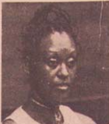
Uganda's foreign minister, Princess ELIZABETH BAGAYA, addressing U.N. General Assembly in New York.

•Called for the withdrawal of foreign troops from South Korea, charging the presence of 38,000 U.S. forces helps to keep in power "a reign of terror under a fascist dictator."