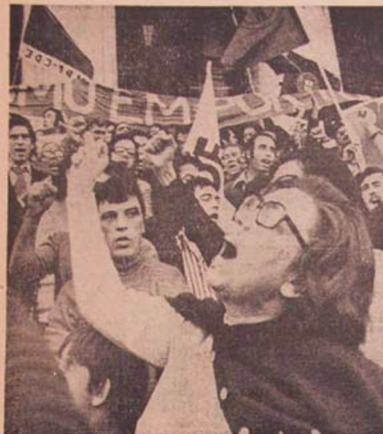
Demonstrators outside the president's palace in Lisbon carried banners and shouted slogans in support of the new government.