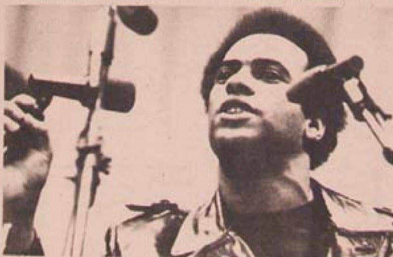
Brother HUEY P. NEWTON, leader and chief theoretician of the Black Panther Party, has long advocated the right of Black people to defend themselves against racist brutality.