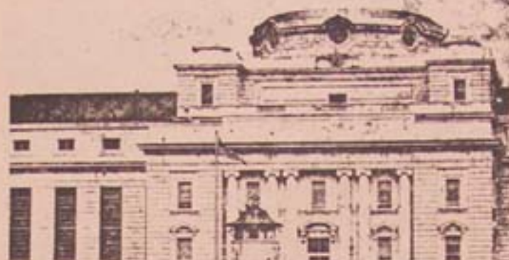
Leavenworth Penitentiary is infamous for inmate repression.