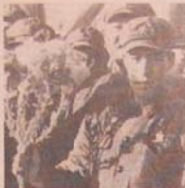
Enthusiastic Chinese people celebrate their 25th anniversary.

Unemployment in China is virtually nonexistent, and the prices of essential food items have remained almost unchanged since 1957. Under the guidance of the Communist Party the Chinese