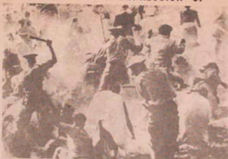
Black South Africans are constantly harassed by racist White policemen. As Black political activists become more outspoken against the White minority government, they will face intensified police repression.

Press reports stated that several leading members of SASO and BPC were being sought by police and that one officer of SASO allegedly fled to Botswana. Police would not reveal details of their repressive activities but admitted that some arrests have