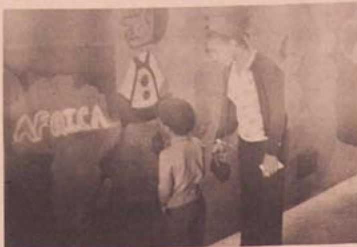
The creativity of Intercommunal Youth Institute students produced this imaginative wall painting.

The parents and teachers did not arbitrarily paint the class-