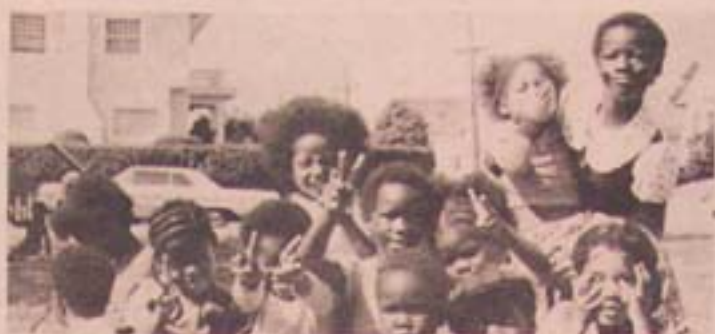
Intercommunal Youth Institute students take pride in their school.

In a written communication left at a San Francisco gas station, the group accused ITT of creating "a reign of terror" in Chile by conspiring to overthrow Salvador Allende, the late Chilean president. □